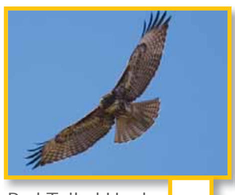
Red Tailed Hawk